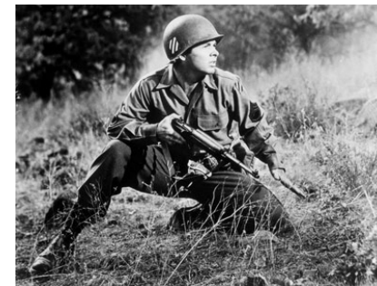
2016 Operation Dragoon group at Audie Murphy's MOH site.