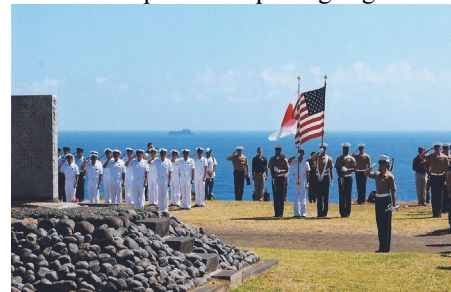
Ceremony on Iwo Jima during 2010 visit. Everyone is expected to attend ceremony before touring the island.

Transfer to airport for departing flights...or continue onto Koror and Peleliu.