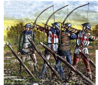
Left: Battle at Agincourt.

Below: A re-enactment, this battle was fought in 1415 in which the army led by King Henry V of England defeated the forces led by Charles d’Albret on behalf of Charles VI of France, and recorded in English history as the Battle of Agincourt.