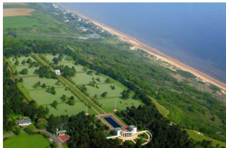
American Cemetery and Memorial, Normandy