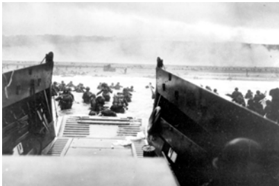
June 6 th 1944, D-Day

Additional nights at the Astrid Centre Hotel Brussels pre-tour and the Mercure Terminus Gare du Nord Hotel Paris post-tour run about $250 per night including tax. Call Valor Tours, Ltd. if you require assistance with air transportation from the U.S. to Paris. Additional arrangements may require additional deposits.