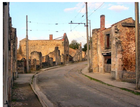
Every June 10 th a commemorative ceremony takes place.