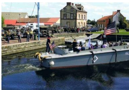
Ride a Higgins Boat at Carentan

We will stay in the heart of old town, Bayeux, within walking distance of the Bayeux Tapestry. Bayeux has its own substantial war museum and British and Commonwealth war cemetery, while the D-Day beaches and many further related World War II museums and memorials lie close by. Our hotel is within easy walking distance of local bars and restaurants.