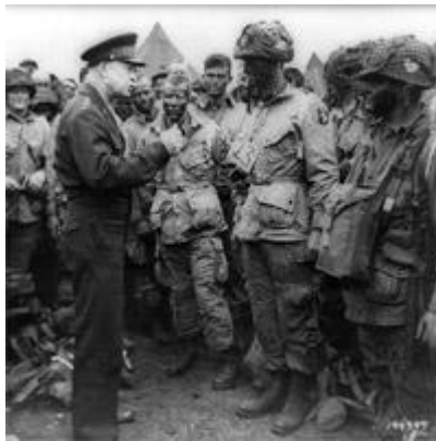
Dwight Eisenhower giving orders to American paratroopers in England on June 6, 1944

Shortly after midnight, 6 June 1944, more than 17,000 American and British paratroopers stepped into space over the heavily mined and fortified beaches of Normandy, the first act in Operation Overlord – the long-awaited Allied invasion of Hitler’s Europe. These brave men were the advance guard of the world’s greatest amphibious operation, the logistics of which even now stagger the imagination: nearly a quarter million fighting men to be loaded aboard almost 7,000 ships of every description under an aerial umbrella of 3,000 planes. Richard Collier, D-Day