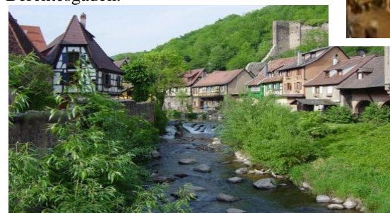
Holtzwihr – Audie Murphy's one man stand.

Depart Strasbourg for scenic days drive through Schwarzwald (Black Forest), crossing territory captured by US 7 th Army and French 1 st Army, into Bavaria. Stop at Gen. Erwin Rommel's house, suicide site and grave in Herrlingen. Stop at Dachau for tour. Overnight Hotel Grunberger, Berchtesgaden.