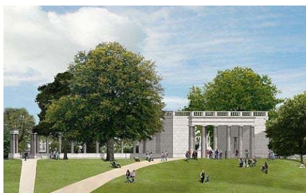
Below: Artist rendition of the Bomber Command Memorial in Green Park, London.