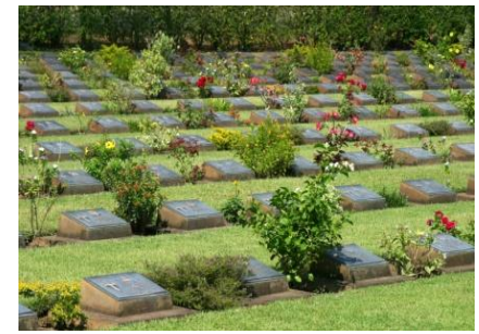
River Kwai War cemetery.