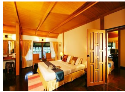
River Kwai Resotel Resort rooms

To ensure worry free travel, this tour includes valuable travel insurance at no additional cost to you. This coverage is provided by TRAVELEX Insurance Services. A description of insurance coverage will be sent to each participant upon receipt of his/her application and deposit. Coverage includes sickness and accident medical expense; trip delay or missed flight connections; medical evacuation and repatriation; baggage and personal effects loss or delay; emergency assistance services worldwide. It does not include cancellation/trip interruption coverage, which is available for $187 per person extra for up to $3000 worth of coverage; $248 for $4000 of coverage; $313 for $5000, etc.