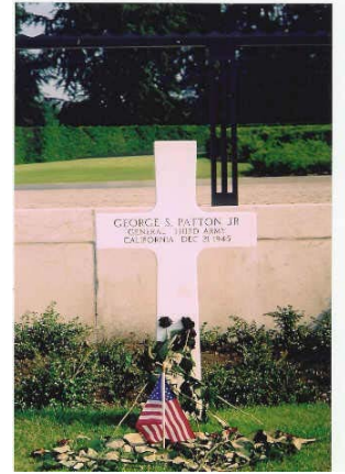
Above: General Patton's grave at Luxembourg.