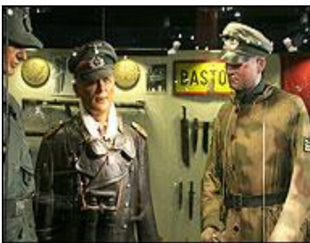
Museum at Bastogne

Check out of hotel and transfer to airport for flights back to the U.S.