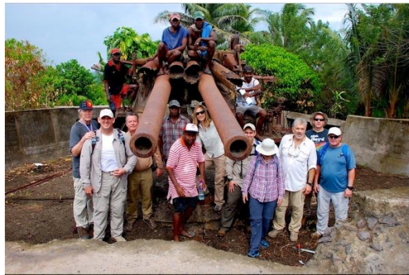
Japanese Guns, Sulfer Creek, Rabaul, 2015

Transfer to airport for Air Niugini flight departing 8:55am, arriving Henderson Field, Guadalcanal 12:15pm...connecting to FJ via Nadi to Los Angeles, arriving same day at 12:45pm.