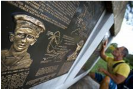
Port Moresby, Bomana War Cemetery, Papua New Guinea Tourism