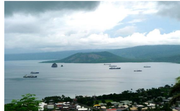
Japanese ships under attack in Simpson Harbor, 1943 and Simpson Harbor, Rabaul today