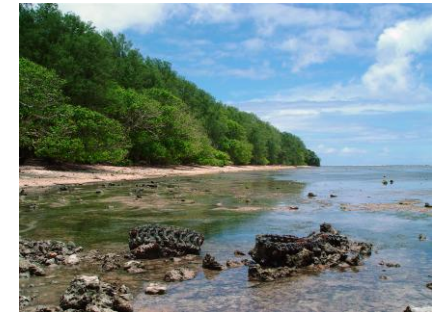
Invasion beaches of Peleliu, then and now.