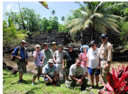
Left: Truk's Eten Island, carved by the Japanese to look like an aircraft carrier. Right: 2013 group at Nan Madol, Pohnpei. Above: Rock Islands from Koror to Peleliu.

Truk, Pohnpei and Koror are known for their snorkeling and scuba diving, and although this is not the purpose of our trip, one is welcomed to take advantage these opportunities by visiting one of many dive shops in or near our hotels.