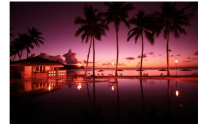
Below sunset in Palau