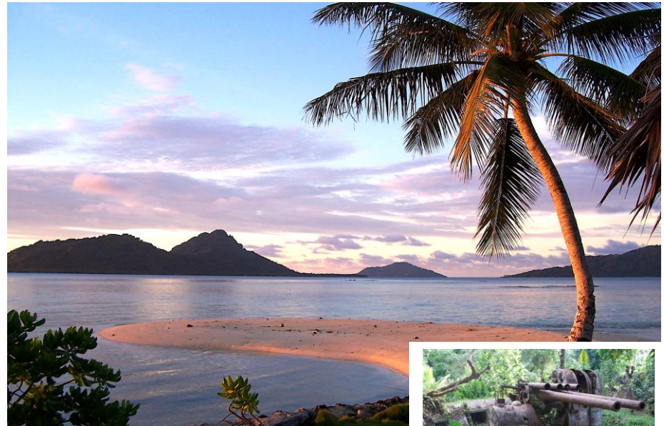
Beach, Blue Lagoon Hotel, Truk Pohnpei