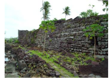
Ancient Nan Madol, Pohnpei

Continue with touring of Peleliu as well as Ngesebus Island, site of Japanese Airfield assaulted by U.S. forces as part of the invasion, but today relatively unexplored and untouched.