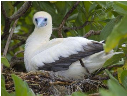
Bird watching too!

Valor Tours Ltd. 10 Liberty Ship Way Suite 110 Sausalito, CA 94965 Tele: 415-332-7850 800-842-4504 Fax: 415-332-6971 Email: valortours@yahoo.com Website: www.valortours.com