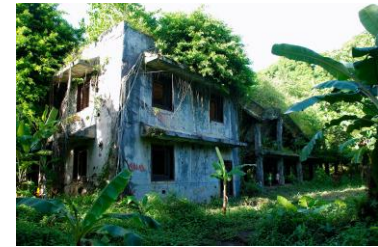
Japanese air administration HQ Truk