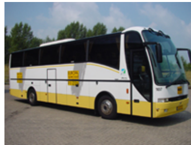
Above left: Canal boat cruise while we visit Amsterdam. Above: Amsterdam. Left: Our private coach throughout tour.