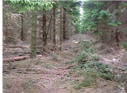
Above: Hurtgen Forest today.