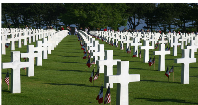
Graves at the American Cemetery, Normandy.