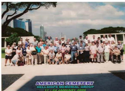
2006 Hellships Memorial tour group