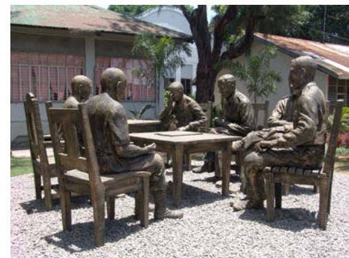
Gen. King's surrender

70 th Anniversary of the Fall of Bataan April 3 to 13, 2012