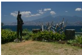
From his HQ's on Corregidor General MacArthur bids farewell to the Philippines vowing "I Shall Return".