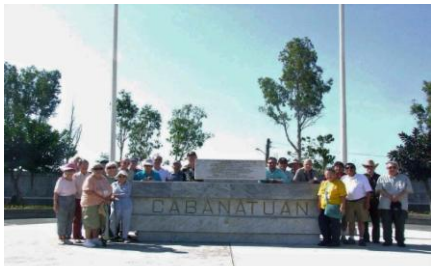
Group at Camp Cabanatuan OG

In the early months of WWII in the Pacific, it was one defeat after another. But in the Philippine Islands American commanders thought the jungles on the peninsula of Bataan could withstand any enemy assault. And surely the heavily armed island of Corregidor in Manila Bay would be impregnable. The enemy thought otherwise, and in April and May of 1942, they proved their point. It was not for lack of determination by our men on Bataan, (or any lack of courage from the nurses who were right there with them) that defeat was followed by a ghastly death march to nightmare years of imprisonment. The nurses were evacuated at the last moment to Corregidor. Incessantly pounded by heavy guns from the now captured Bataan Peninsula, Corregidor itself surrendered on May 6 th . In war, legendary battle sites are not always honored for a victorious outcome. If ever there was hallowed ground from the conflict and horror of war, it is the ground we will once again tread in 2018, as we have done for the past 40 years.