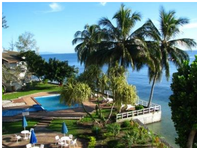
Grounds of our hotel located on Iron Bottom Sounds overlooking Savo Island.