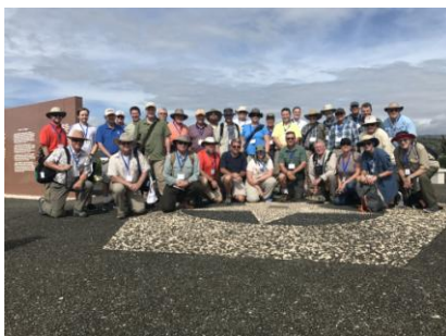
75 th Anniversary group at memorial, 2017