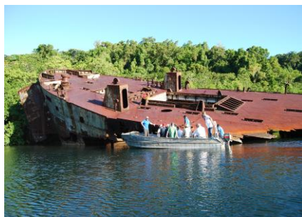
LST 342 in Tokyo Bay near Tulagi

The Solomon Islands campaign lasted twenty months. It was a violent air, land and sea struggle with a determined enemy. This tour offers WWII history and ceremony with sightseeing on this now peaceful and beautiful island. Walk invasion beaches and airstrips – cruise across Iron Bottom Sound past Savo Island, remembering the tremendous losses suffered by the Japanese response to the land invasions. Relics still abound although the jungle now mostly conceals the wounds of battle.