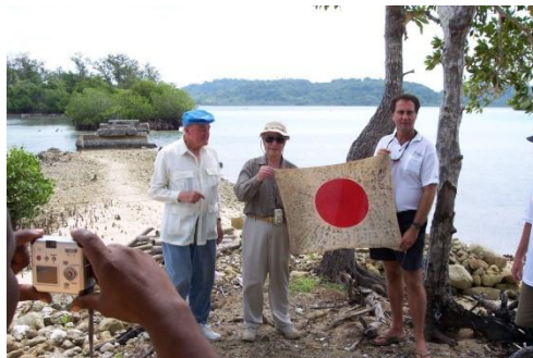
Found Japanese flag on Gavutu during 2004 tour