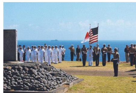
Ceremony on Iwo Jima during 2010 visit. Everyone is expected to attend ceremony before touring the island.

Transfer to airport for departing flights...or continue onto Koror and Peleliu.