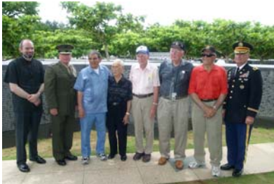
2010 Veterans at ceremony

The U.S. Army 10 th Support Group Commander, Torii Station will host our group for the Army's birthday Ball during our visit to Okinawa.