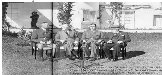
Casablanca Conference, 14-21 January 1943 General Henri Giraud, President Roosevelt, General Charles de Gaulle, and Prime Minister Churchill.

The United States had last sent armed forces to Morocco during the Second Barbary War of 1815. However, on 8 th November 1942 US forces would again be off the coast of Morocco. The Western Task Force was landing on the coast between Port Lyautey and Fedala and Safi. This was the beginning of American involvement in North Africa, other landings would take place in Algeria and before the end of the year American and British forces would be on the outskirts of Tunis. The Panzerarmee Afrika counter-attacked delaying the end, but six months to the day of these landings the war in North Africa would finally be over. While in Morocco we will also look at the most famous desert fighters of them all – the Foreign Legion. We shall follow one of their longest marches, see their longest tunnel and examine two of their typical No Surrender battles. We shall cross the Atlas Mountains and spend one night in a 5* Bedouin encampment. Who wouldn't want a drink in Rick's Café in Casablanca? This is a 5* exclusive and exciting tour that encompasses WW2 and the romance of the desert and the Foreign Legion.