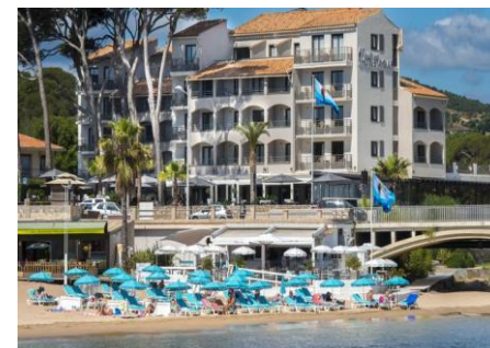
Hotel Saint Aygulf, St. Raphael