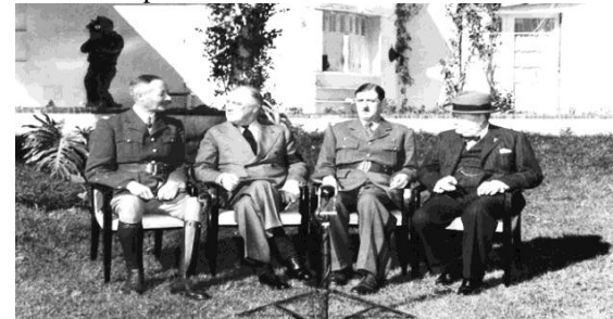
Casablanca Conference, 14-21 January 1943 General Henri Giraud, President Roosevelt, General Charles de Gaulle, and Prime Minister Churchill.

The United States had last sent armed forces to Morocco during the Second Barbary War of 1815. However, on 8 th November 1942 US forces would again be off the coast of Morocco. The Western Task Force was landing on the coast between Port Lyautey and Fedala and Safi. This was the beginning of American involvement in North Africa, other landings would take place in Algeria and before the end of the year American and British forces would be on the outskirts of Tunis. The Panzerarmee Afrika counter-attacked delaying the end, but six months to the day of these landings the war in North Africa would finally be over. While in Morocco we will also look at the most famous desert fighters of them all – the Foreign Legion. We shall follow one of their longest marches, see their longest tunnel and examine two of their typical No Surrender battles. We shall cross the Atlas Mountains and spend one night in a 5* Bedouin encampment. Who wouldn’t want a drink in Ricks Café in Casablanca? This is a 5* exclusive and exciting tour that encompasses WW2 and the romance of the desert and the Foreign Legion.