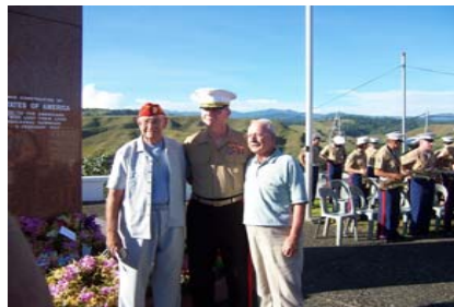
Ceremony at the American Memorial, Guadalcanal

The U.S. offensive of WWII in the Pacific Theater began on August 7 th , 1942 when U.S. Marines landed on Guadalcanal, Tulagi and Gavutu to establish a foothold upon enemy held territory. Thus began the Allied Advance on the road to Tokyo.