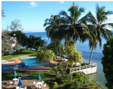
Grounds of our hotel located on Iron Bottom Sounds overlooking Savo Island.