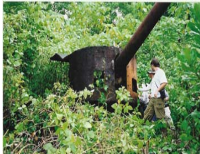
Exploring war relics in the jungle.