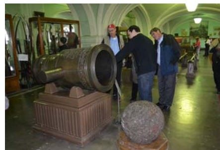
Artillery museum in St. Petersburg

A huge sculpture in the background is entitled "Mother Russia" and is located on the top of Mamaev Hill. This statue is at the top of the complex dedicated to Heroes of the Battle of Stalingrad. The sculpture is one of the largest and most famous monuments in the world. Its height is 52 meters and weights 8 thousand tons.