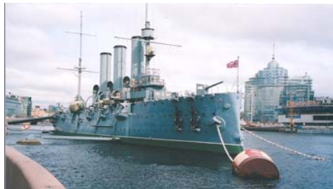
Upper right: Cruiser Aurora in 1910 and below right Cruiser Aurora today.