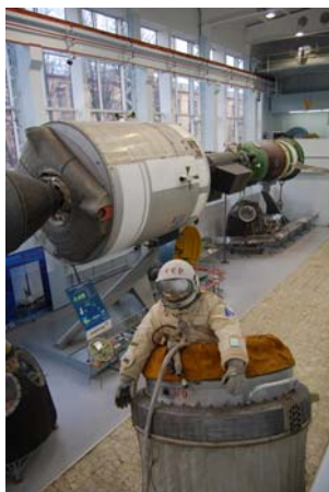
Yuri Gagarin Cosmonaut Training Center

By special invitation, today visit the Yuri Gagarin Cosmonaut Training Center in once classified Star City, the premier training facility for Russian cosmonauts and foreign astronauts. Lunch with Russian cosmonaut who will give first hand account of his training and space missions. Each tour member will receive certificate recognizing his or her visit to Star City. Farewell dinner tonight.