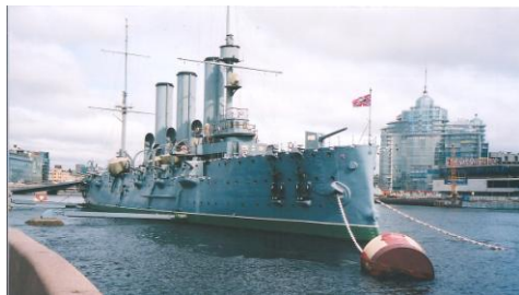
Upper right: Cruiser Aurora in 1910 and below right Cruiser Aurora today.