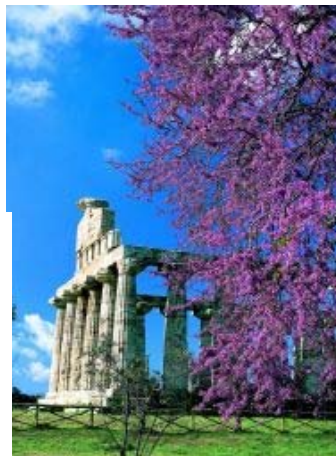
Paestum, southern Italy