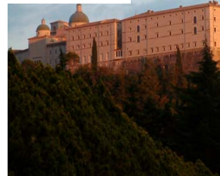
Restored Abbey at Monte Cassino