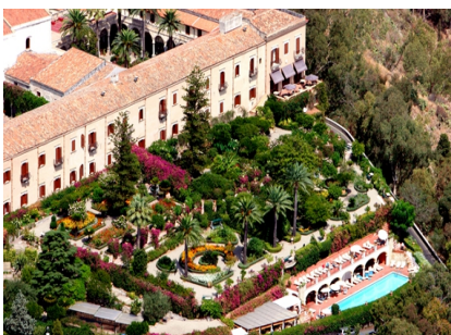
Left: Our last stop on Sicily is the San Domenico Palace Hotel in Taormina overlooking the Mediterranean, General Kesselring's HQ during the war.

Continue to Cassino. Study progress of US Fifth Army from the landings at Salerno to their arrival at Cassino. Study the controversial crossing sites of 141 st Infantry Regt, 36 th Infantry Division on the River Rapido in the First Battle. Overnight Hotel Alba, Cassino. (B L)