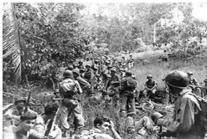
Above: Red Beach. Above right: Veterans standing at the American Memorial. Right: US Marines rest in a field on Guadalcanal in 1942

Here, on and around these islands, in 1942/43, the tide of war in the Pacific was turned. The contest was hard.... The cost was high.... The valor was exemplary.