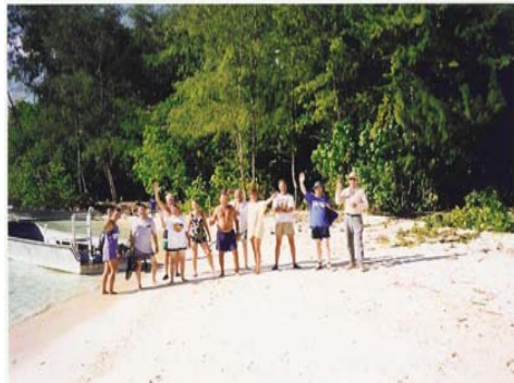
Previous cruise group on Plum Pudding Island where Lt. JFK swam ashore from PT109.

The U.S. offensive of WWII in the Pacific Theater began on August 7 th , 1942 when U.S. Marines landed on Guadalcanal, Tulagi and Gavutu to establish a foothold upon enemy held territory. Thus began the Allied Advance on the road to Tokyo.