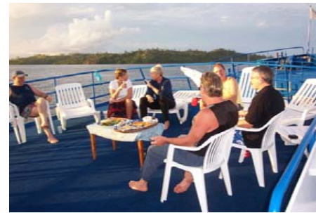
Relaxing on the aft deck.

Due to the absence of handicap and disability laws in the countries we visit, and the expeditionary nature of our tours, we do not recommend participation by passengers with severe disabilities. A companion legally responsible for assisting throughout must accompany passengers with limited disabilities. There is no wheelchair access at all.