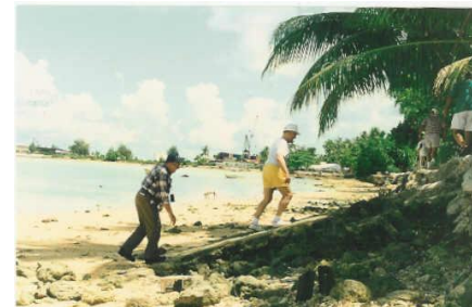
U.S. Marine Veterans retracing their steps on the beach at Betio during previous tour.