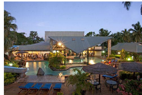
Tokatoka Hotel, Nadi

There may be a $100 per person surcharge on the part of the airlines for stopover.