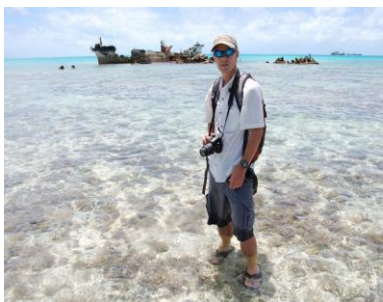
Clay on Tarawa

The Japanese occupied Tarawa just two days after the attack on Pearl Harbor. Following an August 1942 raid by U.S. Marines on Makin to deflect attention from the invasion of Guadalcanal, Japanese Imperial forces fortified the tiny islet of Betio with big guns, bunkers, pillboxes, mines and barbed wire. In November 1943, U.S. Army troops took the island of Makin, while the Marines engaged an entrenched and determined enemy on Betio. The brutal, 76-hour struggle for Tarawa resulted in more than 3,000 Marine casualties and some 5,000 Japanese dead. The hard-fought battle was the first full-scale amphibious assault against a fortified target and taught valuable lessons for the rest of the American island-hopping campaign to defeat Japan.