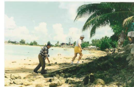
U.S. Marine Veterans retracing their steps on the beach at Betio during previous tour.