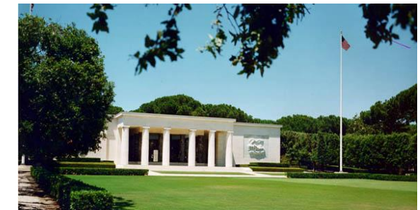
Sicily-Rome American Cemetery and Memorial