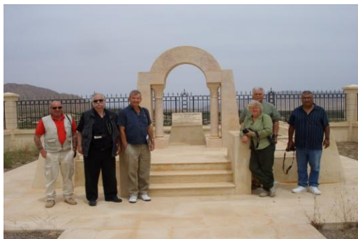
2014 group at the Kasserine Memorial, Tunis