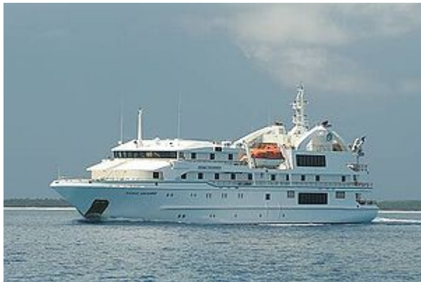
Oceanic Discoverer is a luxury expedition type vessel holding less than 100 passengers and fully equipped with the latest technology.

Air fare from Los Angeles to Noumea, returning to Los Angeles from Rabaul approx $4,000 round trip per person including taxes, economy class.