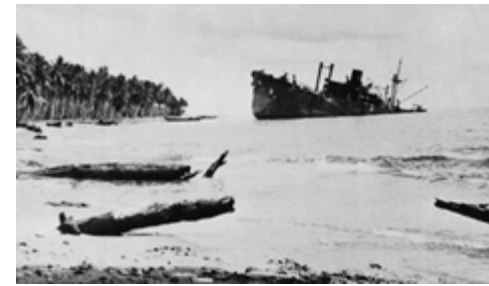
A Japanese transport sunk by US planes

Richard B. Frank is a native of Kansas. After graduation from the University of Missouri, he served four years in the United States Army. His assignments included a tour in Vietnam as a rifle platoon leader with the 101st Airborne Division (Airmobile). Following graduation from Georgetown Law School, he worked for twenty-seven years with the Board of Veterans Appeals.