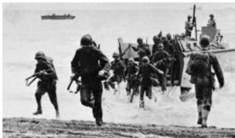
US Troops landing at Guadalcanal

Several battlefields that were featured in the epic HBO mini-series The Pacific will be visited on this cruise, giving us the opportunity to gain a new perspective on the service of Robert Leckie, John Basilone and Eugene Sledge.