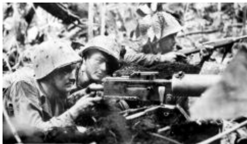
Marines in thick jungle at Cape Gloucester

The Oceanic Discoverer is the ideal way to visit some of the World's most idyllic and untouched destinations in luxury. Passengers are assured of a once-in-a-lifetime cultural and historic experience, combined with the comforts of traveling on a luxury vessel.