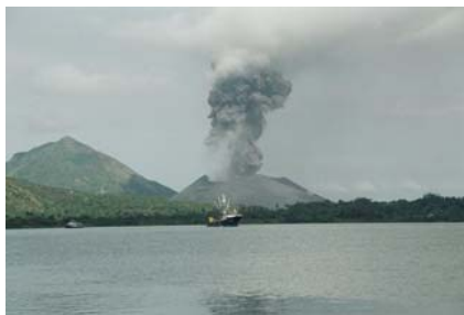
Great view of Rabaul's ever erupting volcano as you cruise into the harbor.