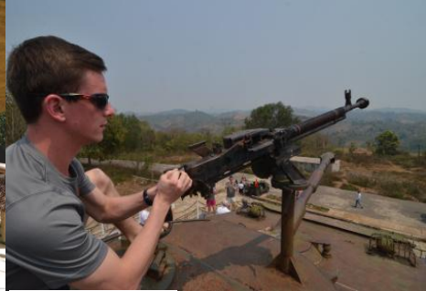
Lang Vei, 2016.

We will fly Eva Airlines 777 – 300 Series jet non-stop from San Francisco to Taipei, then onto Vietnam. Eva Airlines is rated in the top ten best airlines in the World. Stopovers in Taipei, Taiwan on the return are possible for a stopover charge of $100 per person. Frequent flyer awards cannot be used toward the purchase of this tour, but can be earned, through Eva Airlines affiliates. It is the responsibility of the passenger to ensure you are credited with awards. Business class upgrade available for approx. $3825.00 per person, round trip additional.