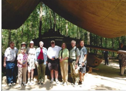
2014 group at outdoors museum