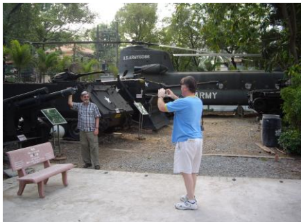
2010 group at war relic's museum, Saigon