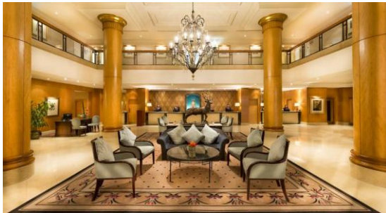
Gloucester Millennium, London

After breakfast transfer to airport or train station. Tour ends.