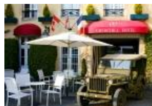
Churchill Hotel, Bayeux

Valor Tours Ltd. valortours@yahoo.com 10 Liberty Ship Way, Suite 110, Sausalito, CA 94965