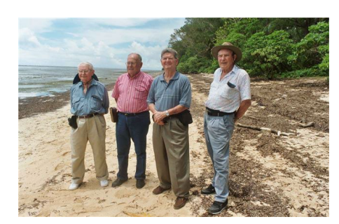
WWII Veterans stand on one of the invasion beache during our 60th Anniverwsary return to Peleliu