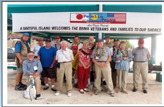
60th Anniversary group of Veterans at Peleliu, 2004