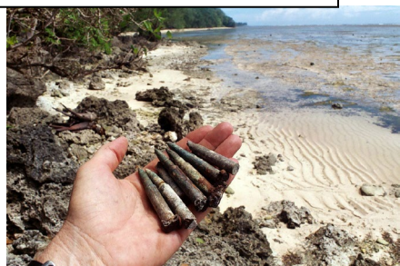
Evidence of the battle still washes up on the beach