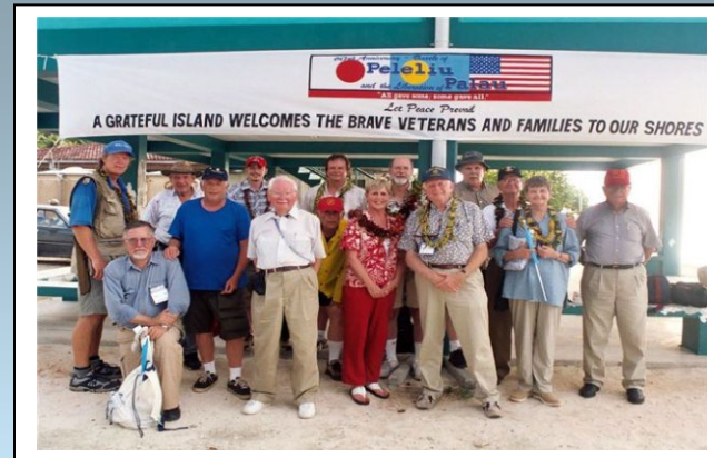
60th Anniversary group of Veterans at Peleliu, 2004