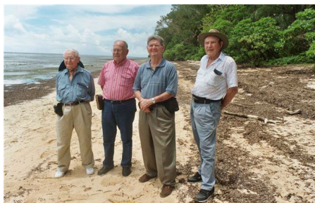
WWII Veterans stand on one of the invasion beaches during our 60 th Anniversary return to Peleliu