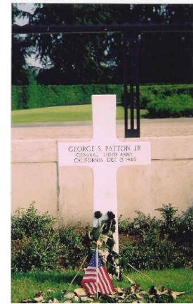
Left: The Sherman tank of the 11th US Armored Division "Thunderbolt" was completely renovated and is a major monument in Bastogne. Right: Patton's Grave in Luxembourg.