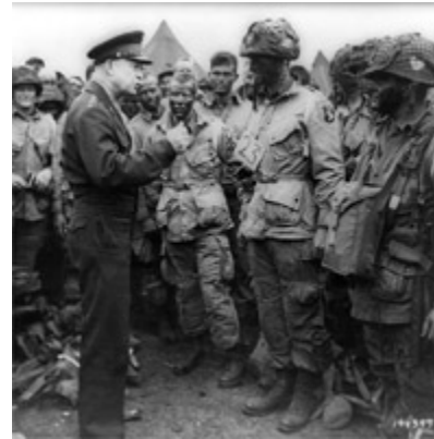
Dwight Eisenhower giving orders to American paratroopers in England on June 6, 1944

Additional nights in Paris $125.00 per night per person twin share, incl. taxes. $250.00 single occupancy. Individual transfers will be arranged from the airport to our hotel in Paris located in the Opera district.