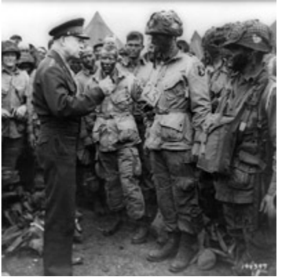
Dwight Eisenhower giving orders to American paratroopers in England on June 6, 1944

Additional nights in Paris $145.00 per night per person twin share, incl. taxes. $290.00 single occupancy. Individual transfers will be arranged from the airport to our hotel in Paris located in the Opera district.