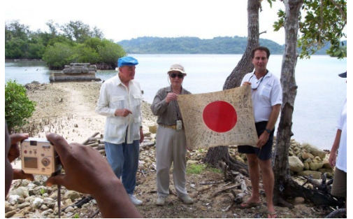
Found Japanese flag on Gavutu during 2004 tour