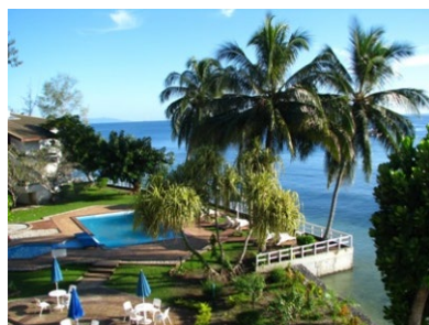
Grounds of our hotel located on Iron Bottom Sounds overlooking Savo Island.