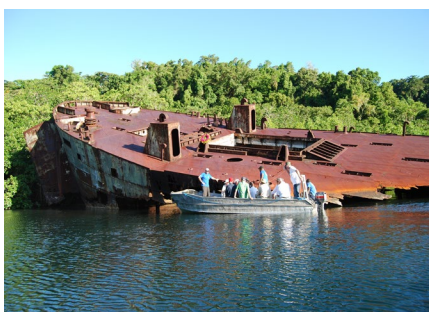
LST 342 in Tokyo Bay near Tulagi

The Solomon Islands campaign lasted twenty months. It was a violent air, land and sea struggle with a determined enemy. This tour offers WWII history and ceremony with sightseeing on this now peaceful and beautiful island. Walk invasion beaches and airstrips – cruise across Iron Bottom Sound past Savo Island, remembering the tremendous losses suffered by the Japanese response to the land invasions. Relics still abound although the jungle now mostly conceals the wounds of battle.