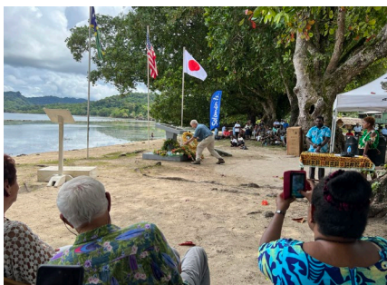
80 th Anniversary wreath laying, Tulagi