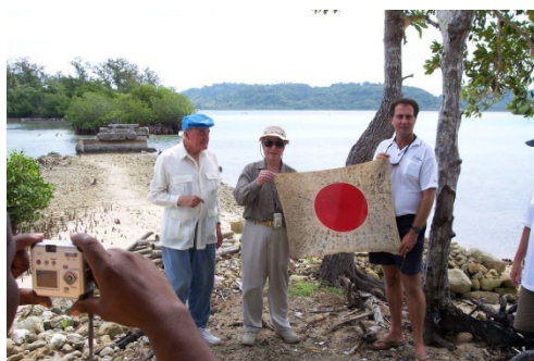
Found Japanese flag on Gavutu during 2004 tour