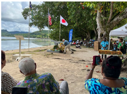
80 th Anniversary wreath laying, Tulagi