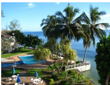
Grounds of our hotel located on Iron Bottom Sounds overlooking Savo Island.