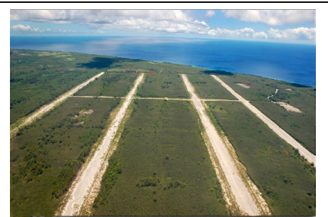
North Field, Tinian, today.

No visas or inncoluation are needed for this tour. Only a passport valid at least six months beyond date of travel. We do not recommend children under the age of 12 years of age particpate.