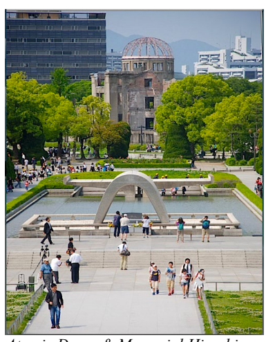
Atomic Dome & Memorial Hiroshima