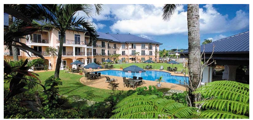
Tradewinds Hotel, Pago Pago, American Samoa