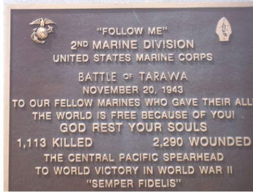
Valor Tours, Ltd. made the arrangements for a group of 50 Second Marine Division Veterans and their wives to visit Tarawa in November 1988 to dedicate their new memorial (plaque above).

The Japanese occupied Tarawa just two days after the attack on Pearl Harbor. Following an August 1942 raid by U.S. Marines on Makin to deflect attention from the invasion of Guadalcanal, Japanese Imperial forces fortified the tiny islet of Betio with big guns, bunkers, pillboxes, mines and barbed wire. In November 1943, U.S. Army troops took the island of Makin, while the Marines engaged an entrenched and determined enemy on Betio. The brutal, 76-hour struggle for Tarawa resulted in more than 3,000 Marine casualties and some 5,000 Japanese dead. The hard-fought battle was the first full-scale amphibious assault against a fortified target and taught valuable lessons for the rest of the American island-hopping campaign to defeat Japan.