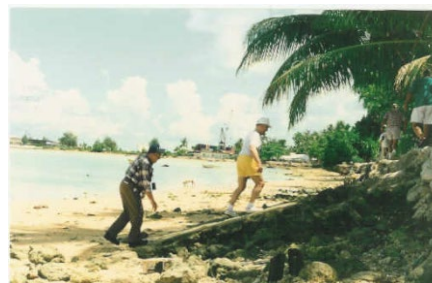
U.S. Marine Veterans retracing their steps on the beach at Betio during previous tour.