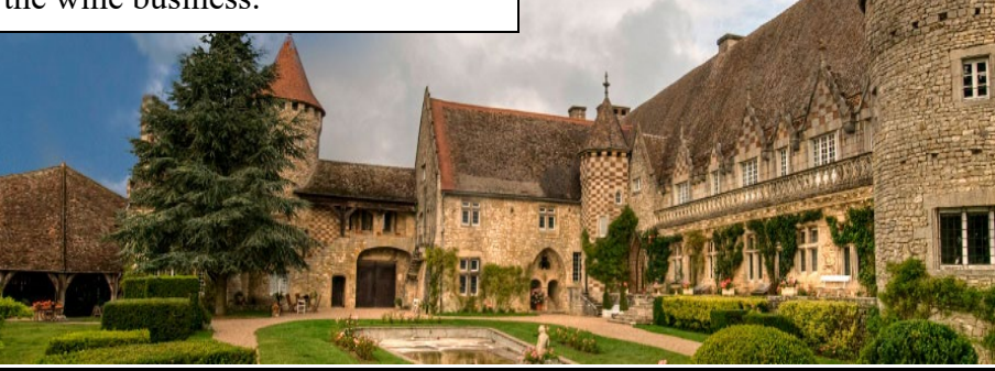
We will spend four nights at the Hattonchatel Chateau, outside of Verdun.